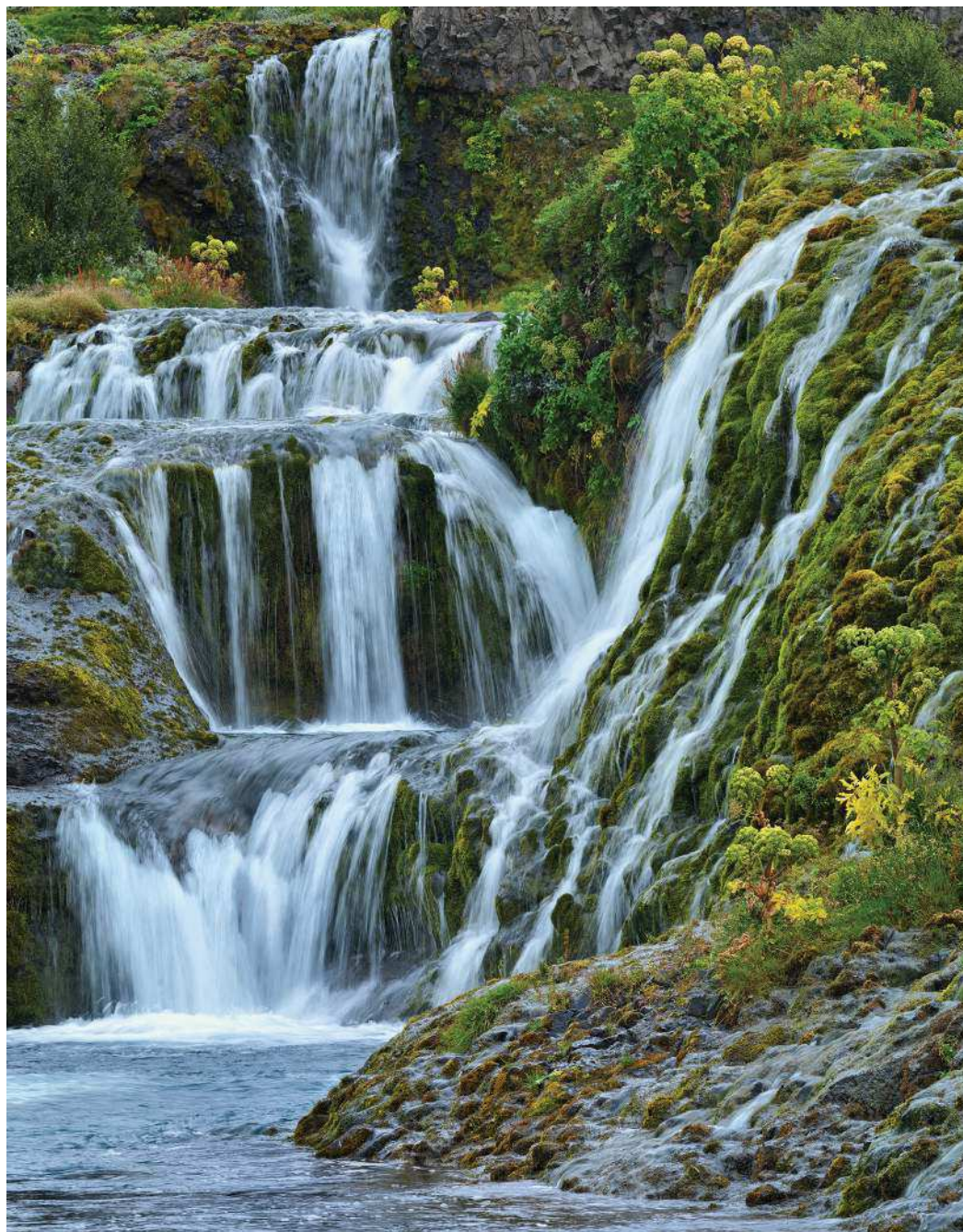
Water in a river is a free good

Free goods are much rarer. When most people talk about free goods, they mean products they do not have to pay for. These are not usually free goods in the economic sense since resources have been used to produce them. Economists define a free good as one that takes no resources to make it. It is hard to think of examples of free goods. Sunshine is one such example, so is water in a river. However, as soon as this water is processed for drinking, or used for irrigation of fields, it becomes an economic good.